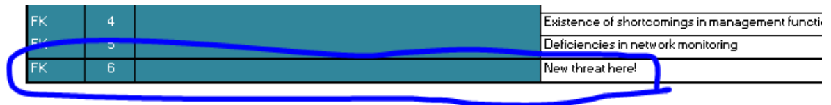
Figure 4. Insert new base threat under the "Base threat " tab

Then you create a new tab (Figure 5) with the same name, eg FK 6 and write the same Name of the threat that you wrote under the tab "Bese threat ". You can advantageously copy an existing tab. Then go to the "Compilation" tab (Figure 6) and press the Update Compilation button and the new base threat will be posted in the Compilation of threats column for the objects.